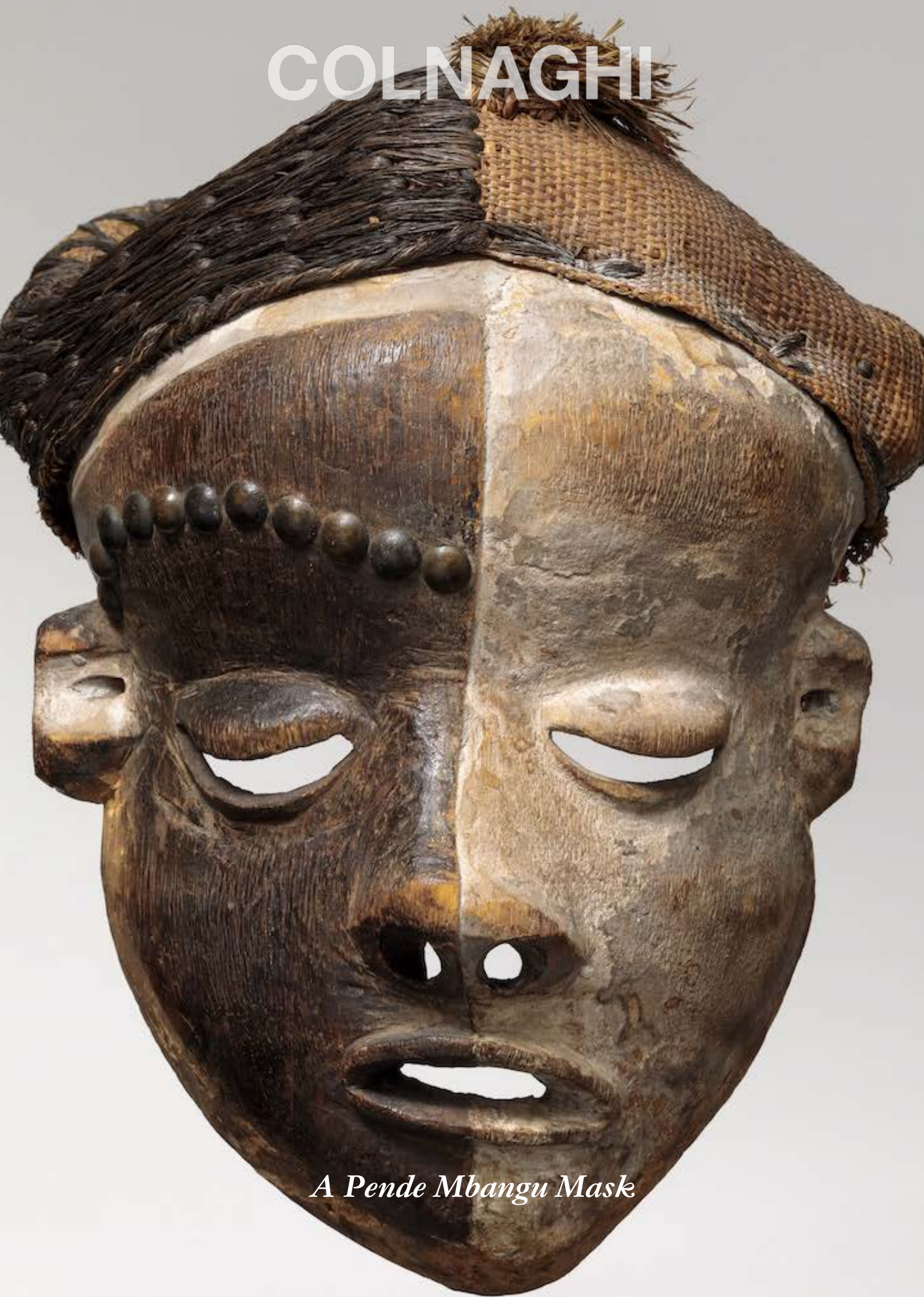
A Pende Mbangi Mask